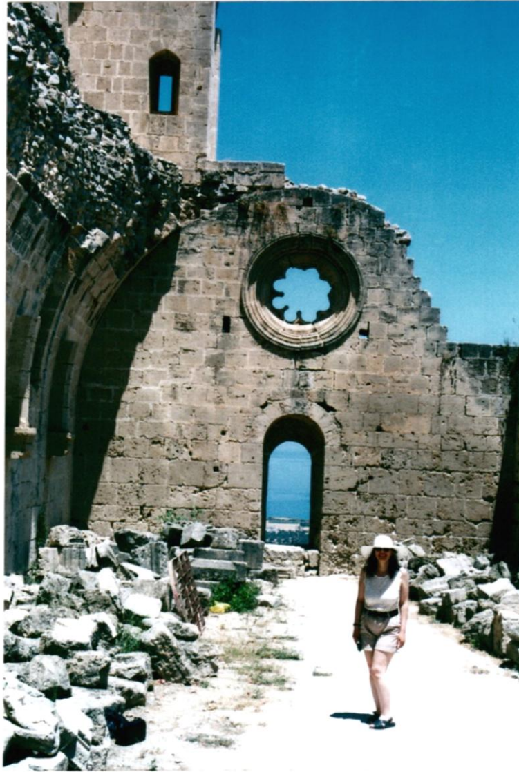
Walking around Mediterranean ruins!