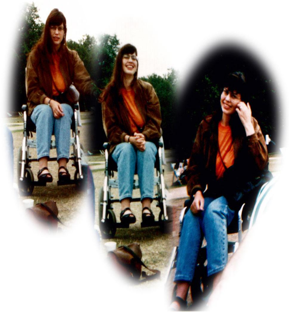
In Hyde Park, 1996