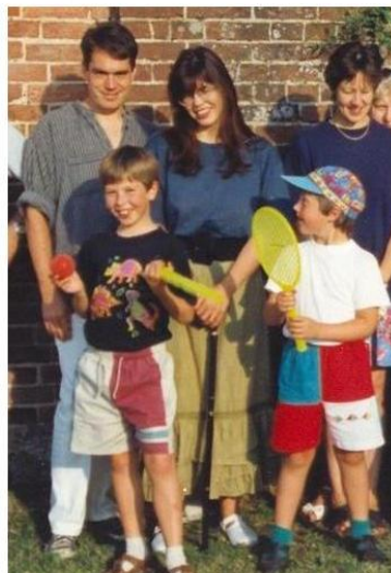
Propped up with stick (detail of the day out.)