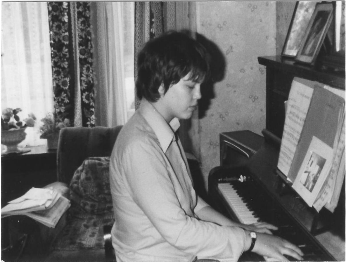
At a time of remission, three years into M.E. Here, playing the piano aged 17, at my Grandmother's house in York.