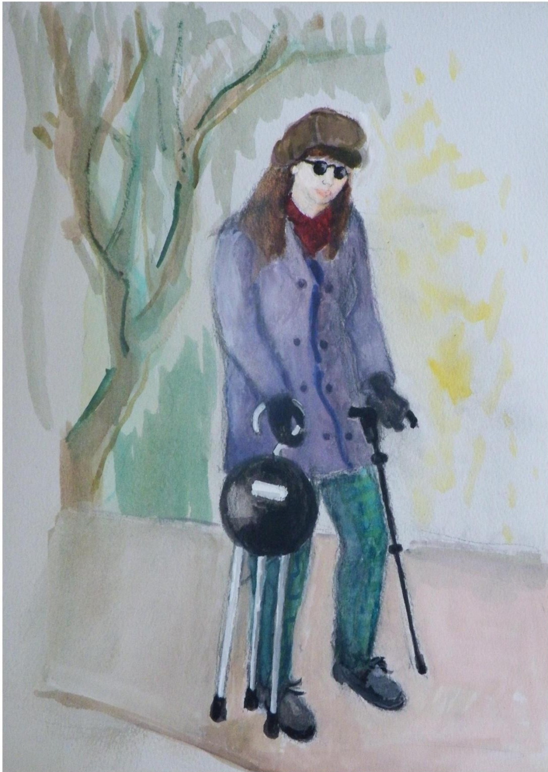
This painting is how many people remember me with M.E: dressed warmly with my seat-stick.