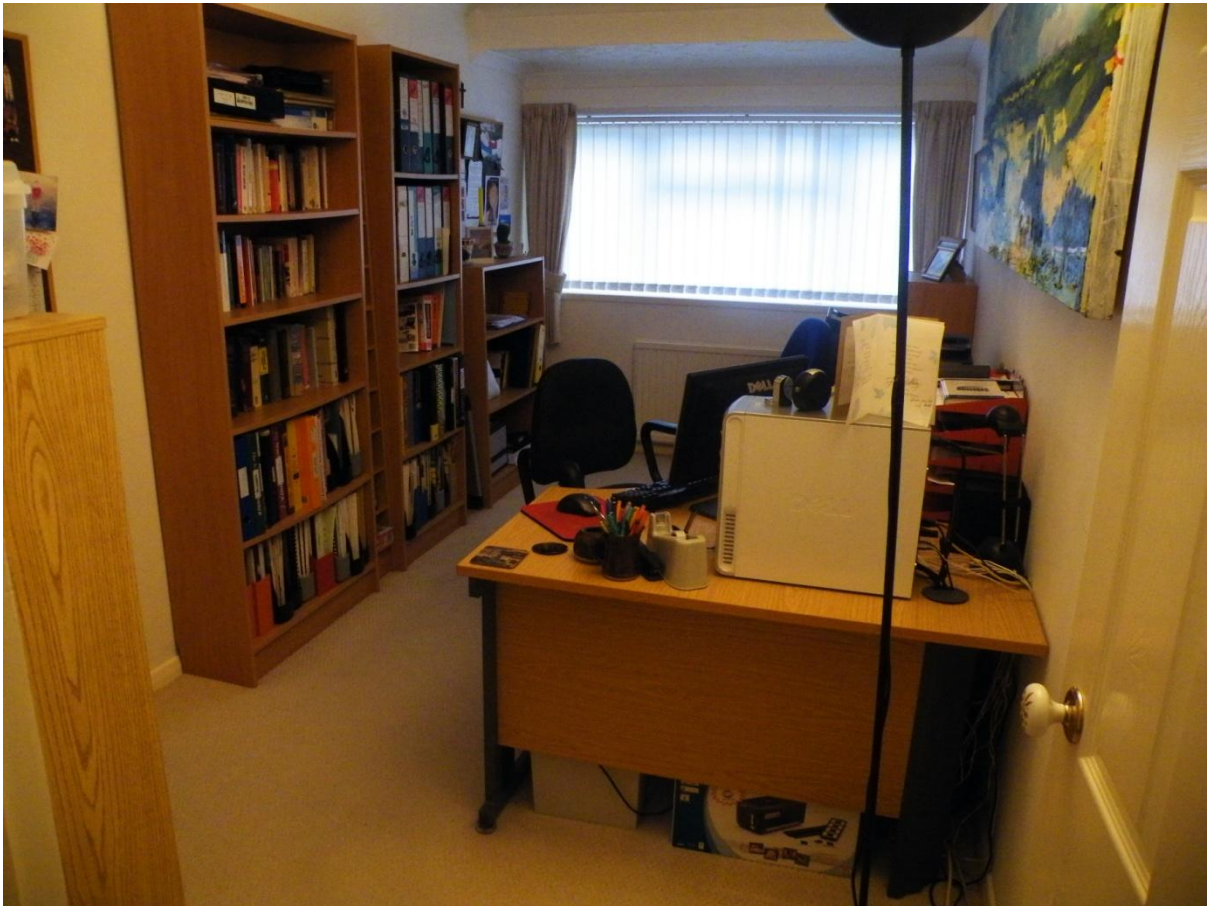
The Grace Charity Office 2011