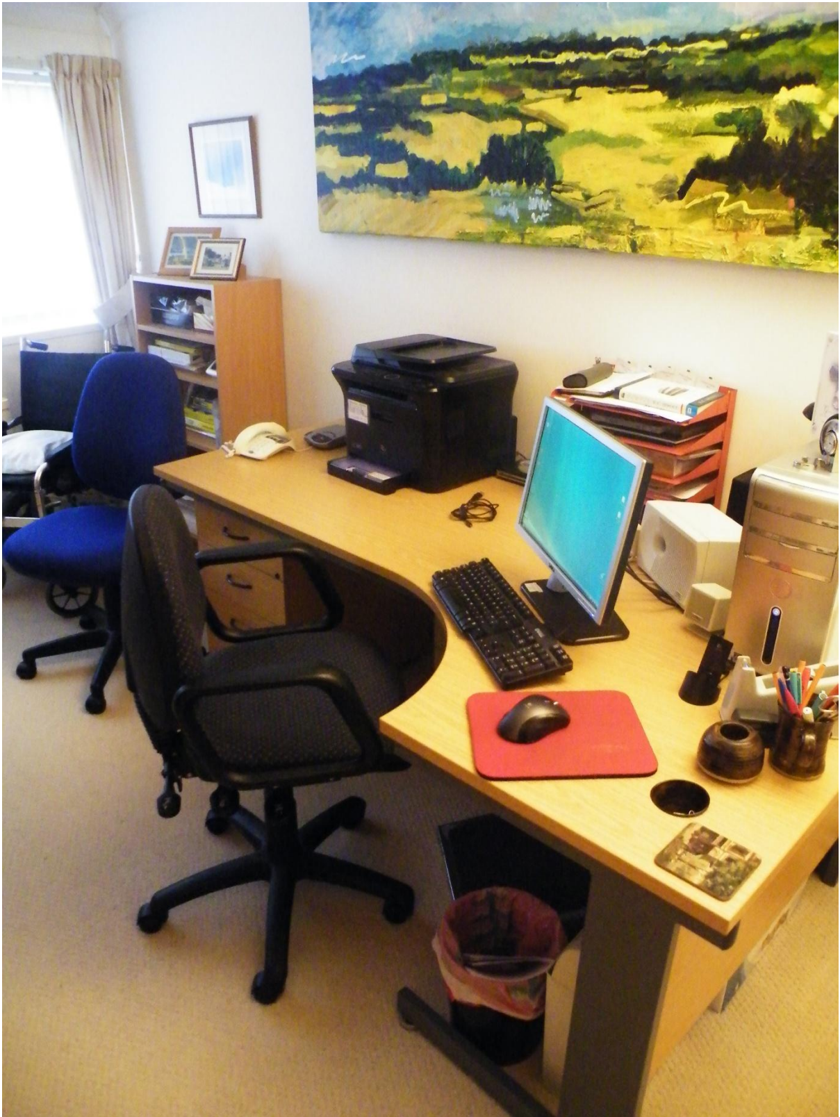
The Grace Charity Office 2011