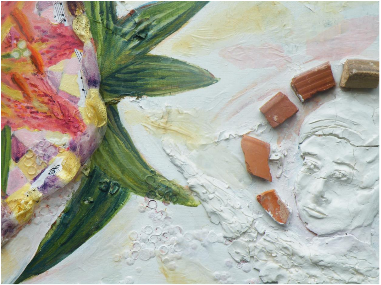
New Life (detail) Mixed media 2011 C. Ashenfelter