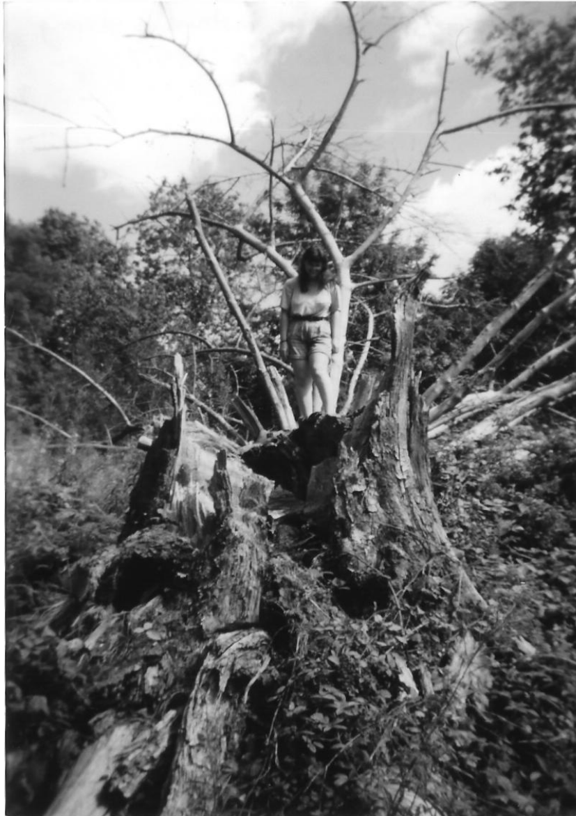
I climbed this huge fallen tree in Hawkhurst just two days after my healing. My legs were instantly strong after the prayer.